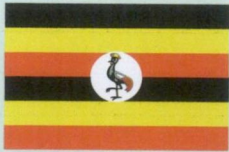
Uganda's National Flag