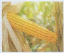
Maize is the most common staple food in Uganda.