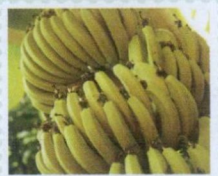
Banana (Matooke): Uganda produces the third largest amounts of bananas worldwide.