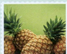
Pineapple is one of the most common fruits in Uganda.

I learnt a verse in 1 Corinthians 15:58. There fore my dear brothers give your selves fully to the work of the Lord, because you know that your labour in the Lord is not in vain. I Love you