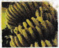
Banana (Matooke): Uganda produces the third largest amounts of bananas worldwide.