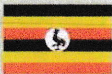
Uganda's National Flag