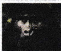
Mountain Gorilla: Uganda is home to more than 50% of the world's mountain gorillas.