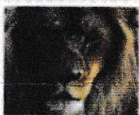
Lion: Lions can be seen in several national parks in Uganda.