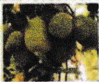
Jack Fruit: Most children in Uganda like eating jack fruit