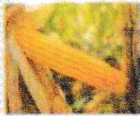
Maize is the most common staple food in Uganda.