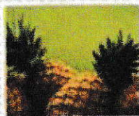
Pineapple is one of the most common fruits in Uganda.

I used the gift to buy goat. Additionally I thank God for adding me another year. I'm now growing at a high speed not only physically but also spiritually. I'm in scripture union in our School as I do practice fellowship and am a leader of a small prayer group. I know that every thing is moving well on my side because of your prayers.