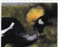
Crested Crane: Uganda's National Bird