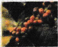
Coffee is one of Uganda's main exports.