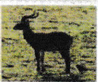
Uganda Kob: Uganda's National Animal